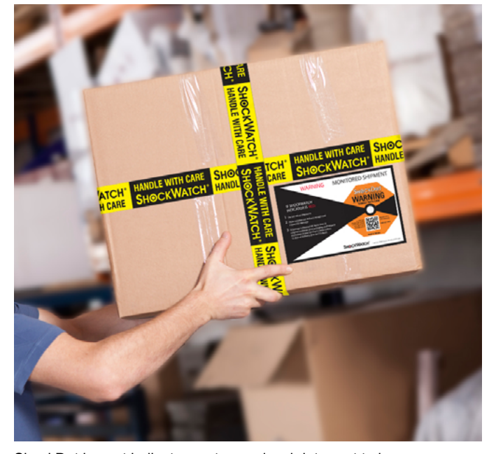
ShockDot impact indicators act as a visual deterrent to improper handling and can help reduce costs related to shipping damage.